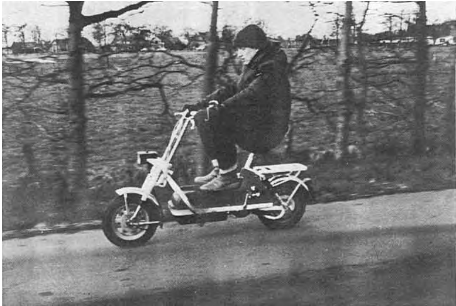
West German gravity-field unit in operation